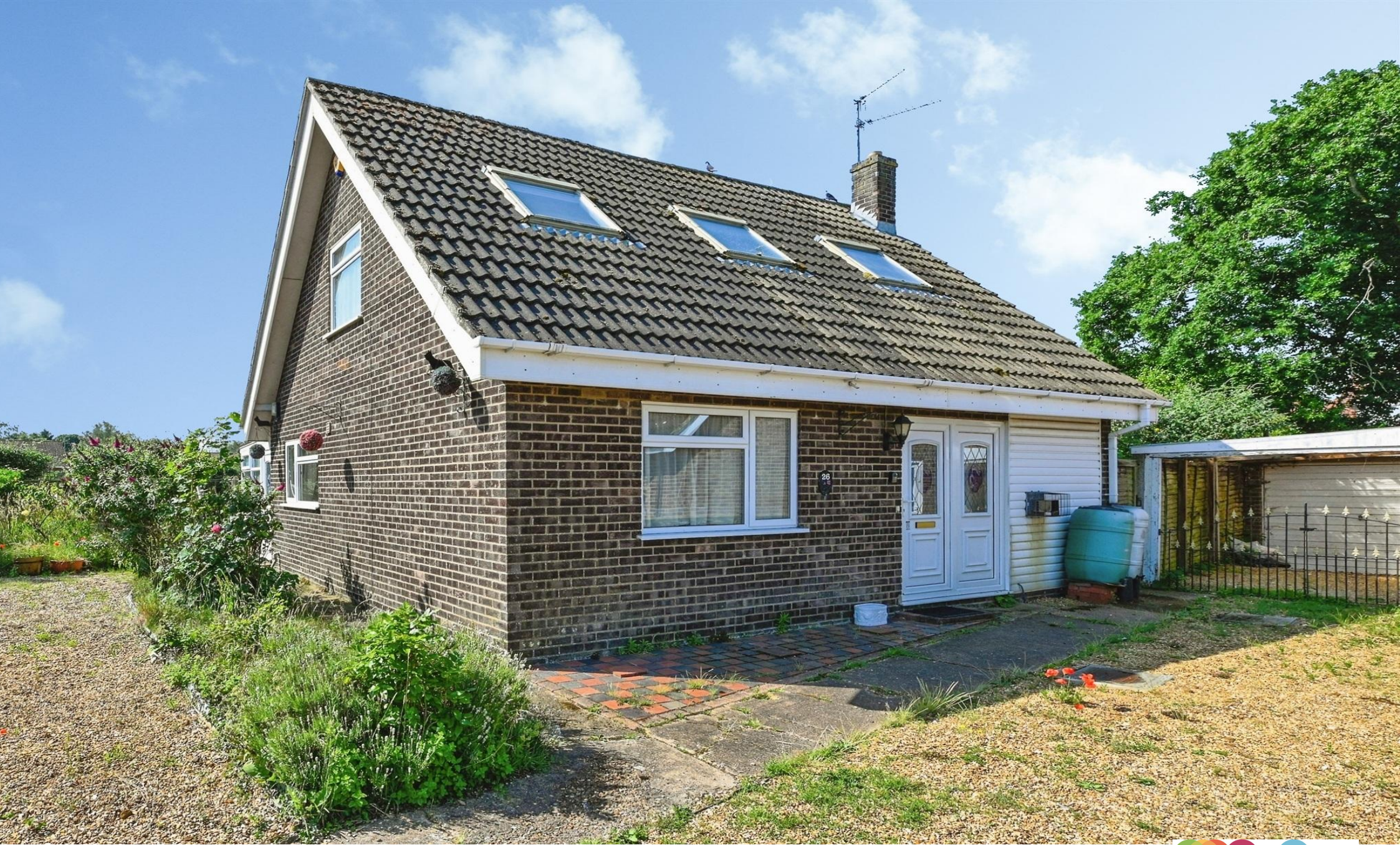
The Grove, Grimston, King's Lynn, PE32 1DG