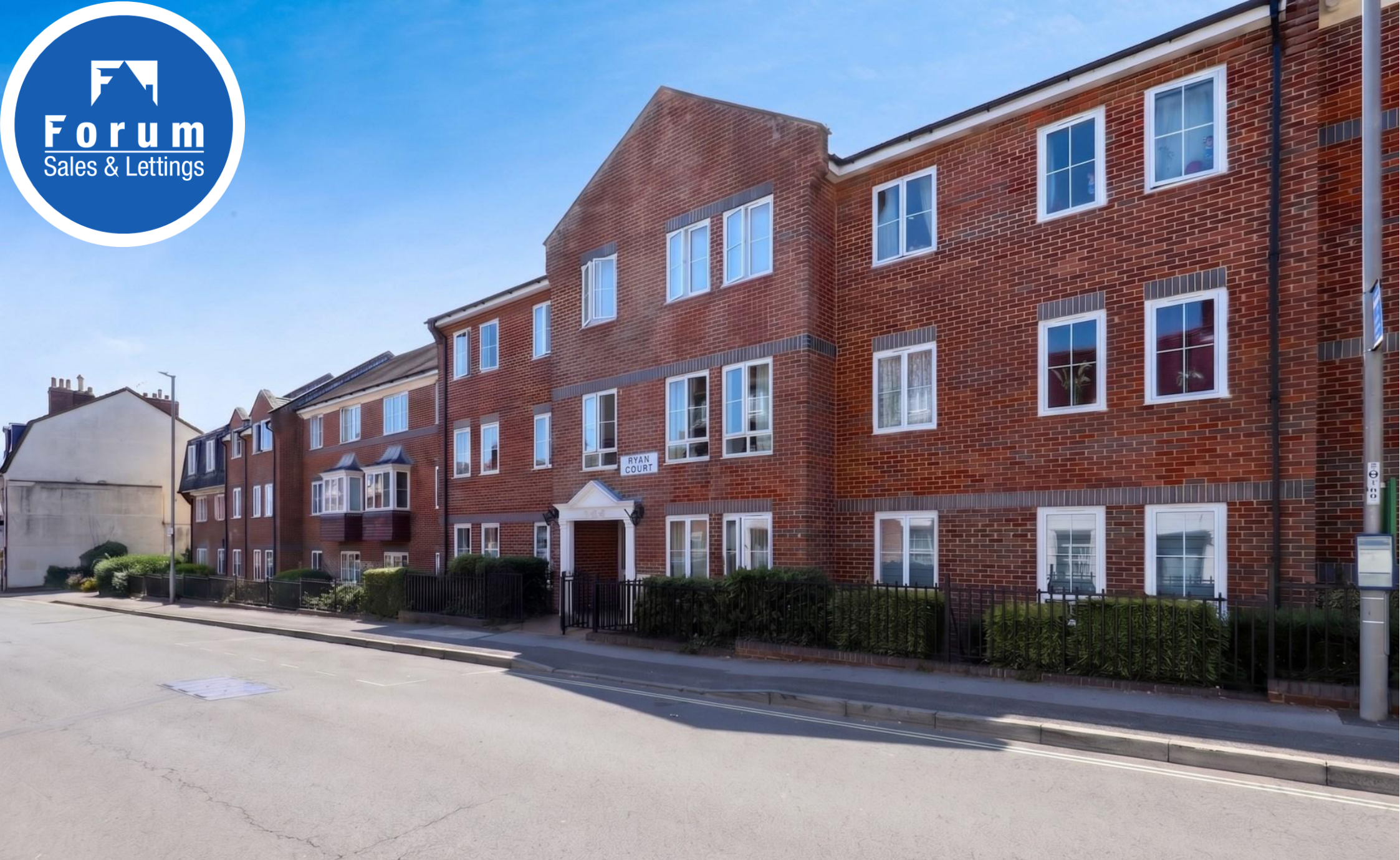
Flat 3, Ryan Court, White Cliff Mill Street, Blandford Forum, Dorset, DT11 7DQ