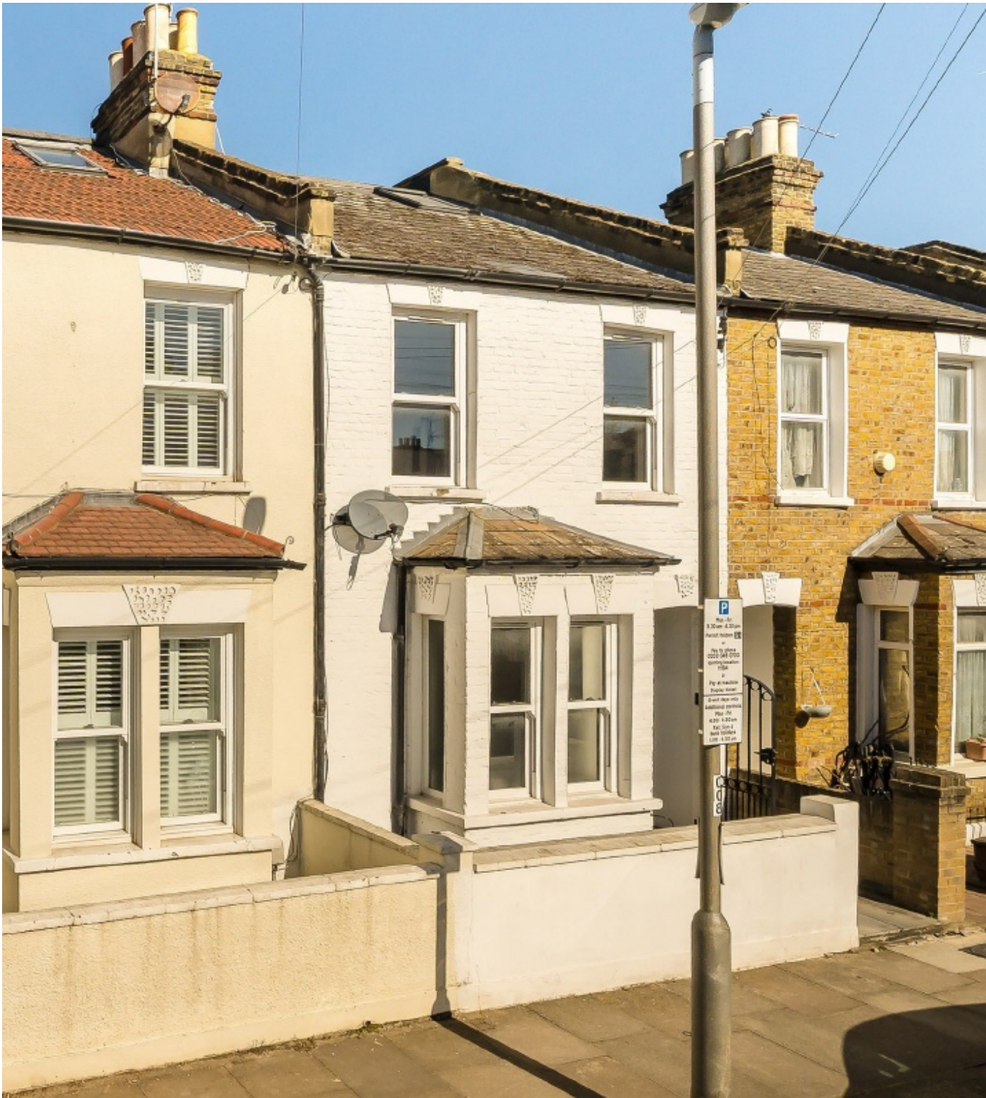
Huntspill Street, SW17 £950,000