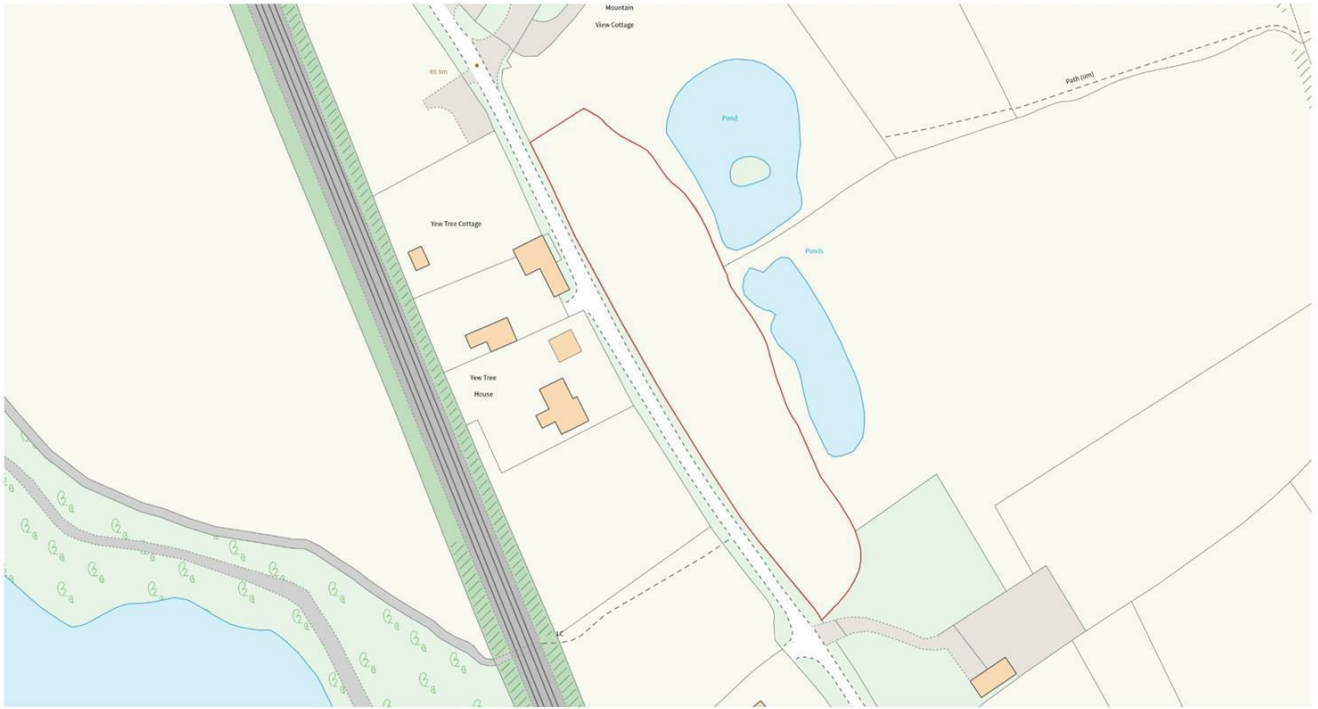
Produced on Land App, May 8, 2026. © Crown copyright and database rights 2026 (Ordnance Survey licence number 100059532)