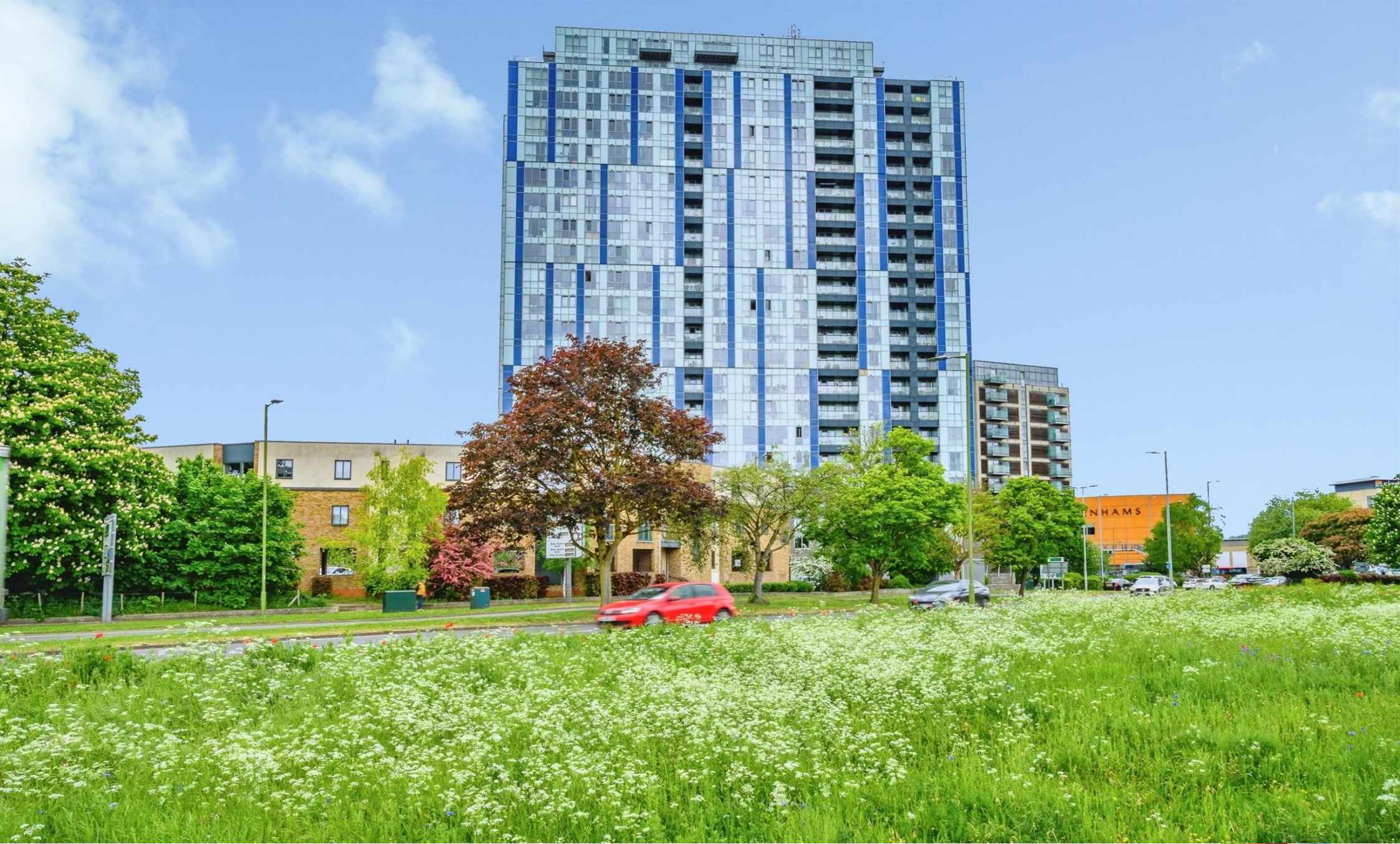
Kd Tower Cotterells, Hemel Hempstead HP1 1AU