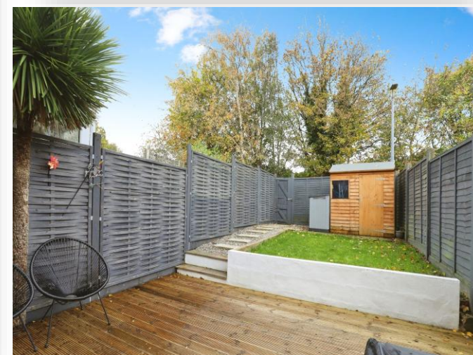
Monks Way,BOURNEMOUTH BH11 9TR