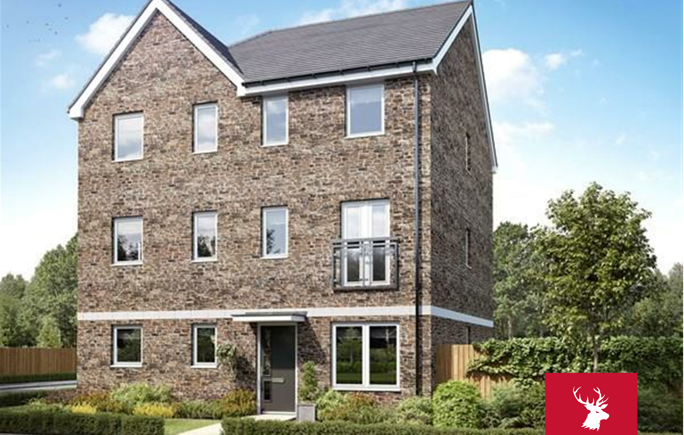
The Ashdown, plot 146