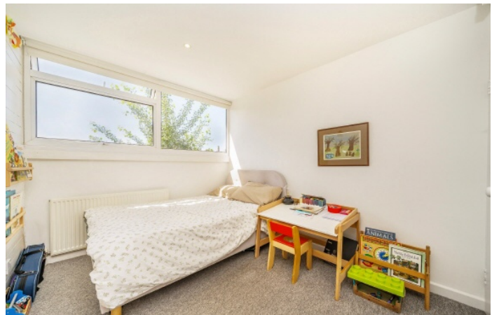
Combe Avenue, SE3