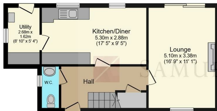
Ground Floor Floor area 49.7 sq.m. (535 sq.ft.)