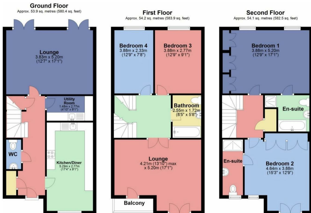
Total area: approx. 162.3 sq. metres (1746.8 sq. feet)