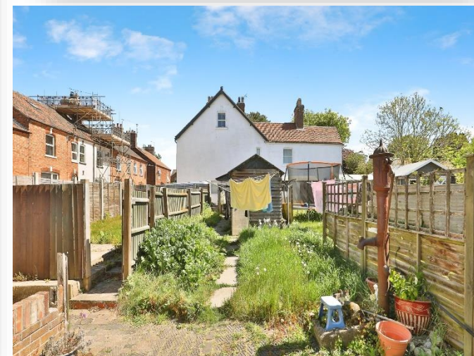
Church Lanes, Fakenham NR21 9DE