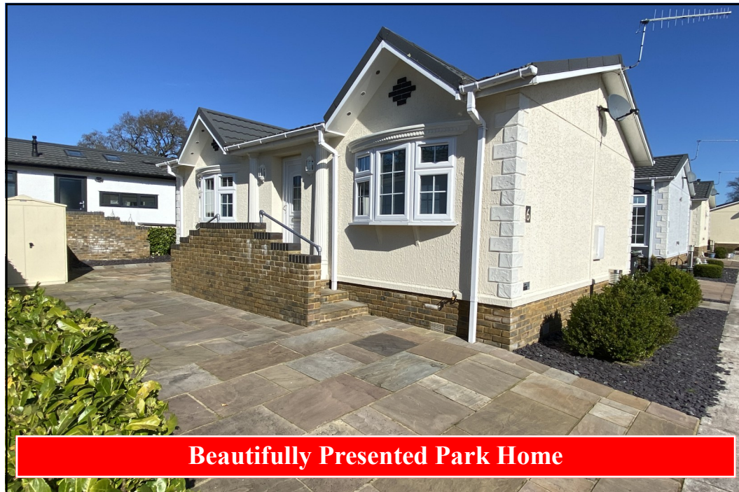
Beautifully Presented Park Home

6 Jasmine Court, Organford Manor Country Park, Poole. BH16 6ES