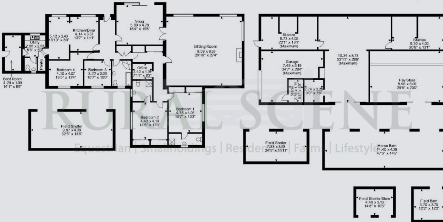
FOR ILLUSTRATIVE PURPOSES ONLY - NOT TO SCALE