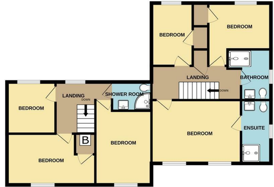
TOTAL FLOOR AREA : 2022 sq.ft. (187.8 sq.m.) approx.

Whilst every attempt has been made to ensure the accuracy of the floorplan contained here, measurements of doors, windows, rooms and any other items are approximate and no responsibility is taken for any error, omission or mis-statement. This plan is for illustrative purposes only and should be used as such by any prospective purchaser. The services, systems and appliances shown have not been tested and no guarantee as to their operability or efficiency can be given. Made with Metropix ©2026