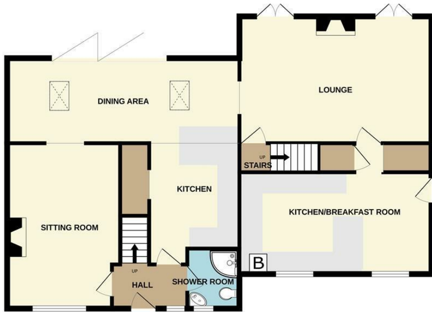
GROUND FLOOR 1107 sq.ft. (102.9 sq.m.) approx.