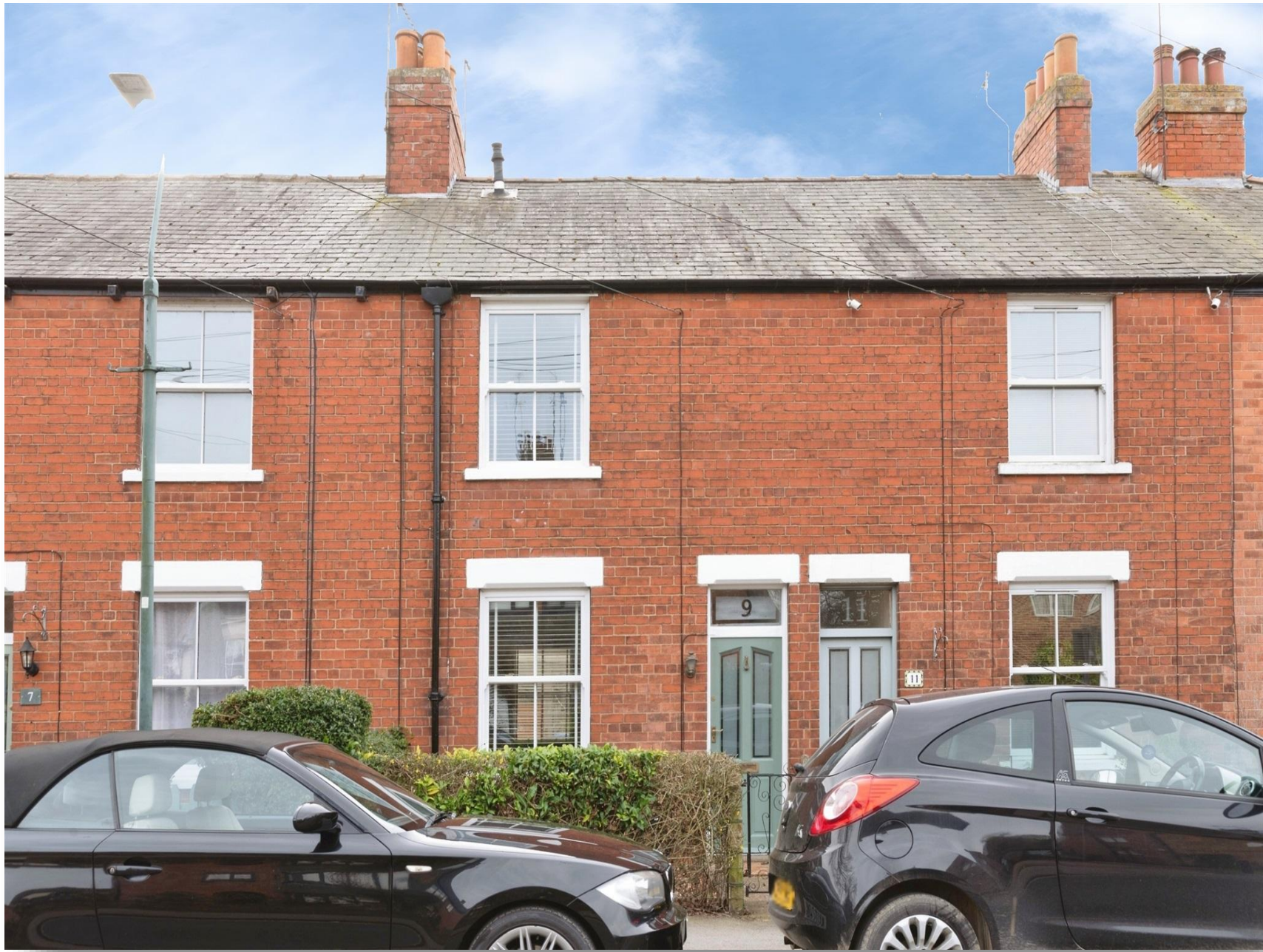
Grayburn Lane, Beverley, HU17 8JR