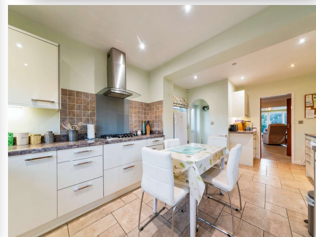
Little Orchard Hargon Lane, Winthorpe Newark NG24 2NP