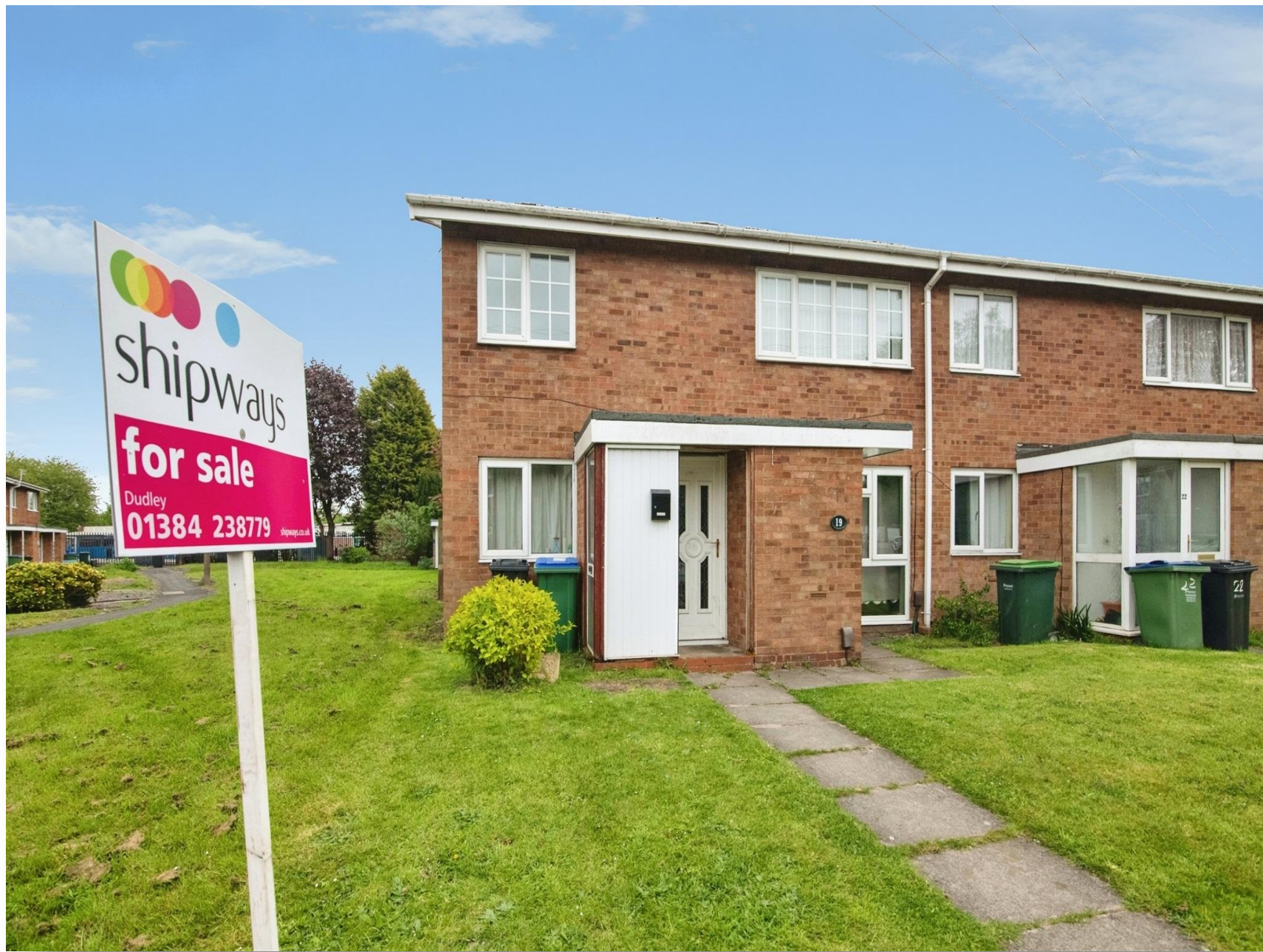
Oakthorpe Gardens, Tividale Oldbury B69 2LE