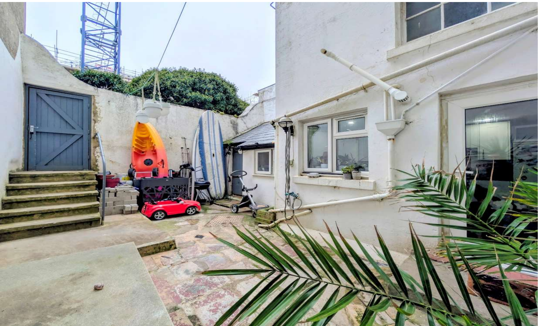
Bedford Row, Worthing BN11 3DR