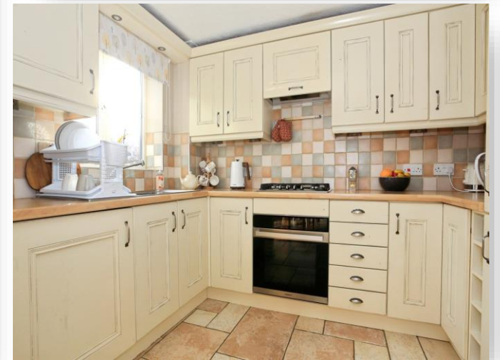
Redwing Close, Stanground, Peterborough, PE2 8SS