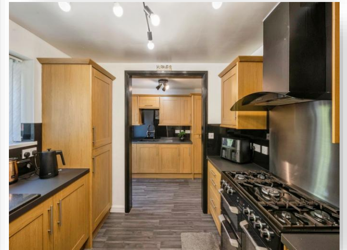
Pastures Mews, Mexborough S64 0HQ