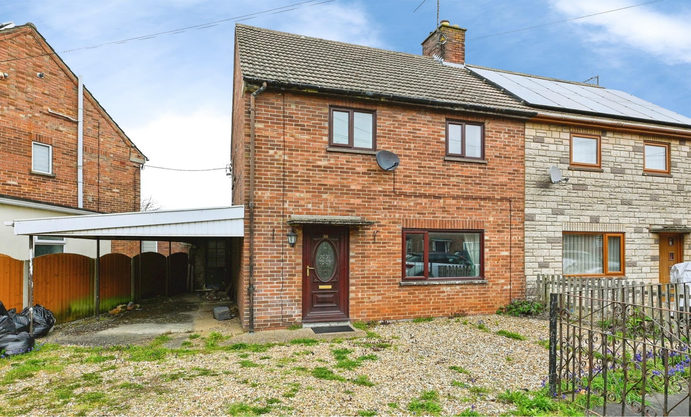
Sculthorpe Avenue, West Lynn, King's Lynn, PE34 3NF