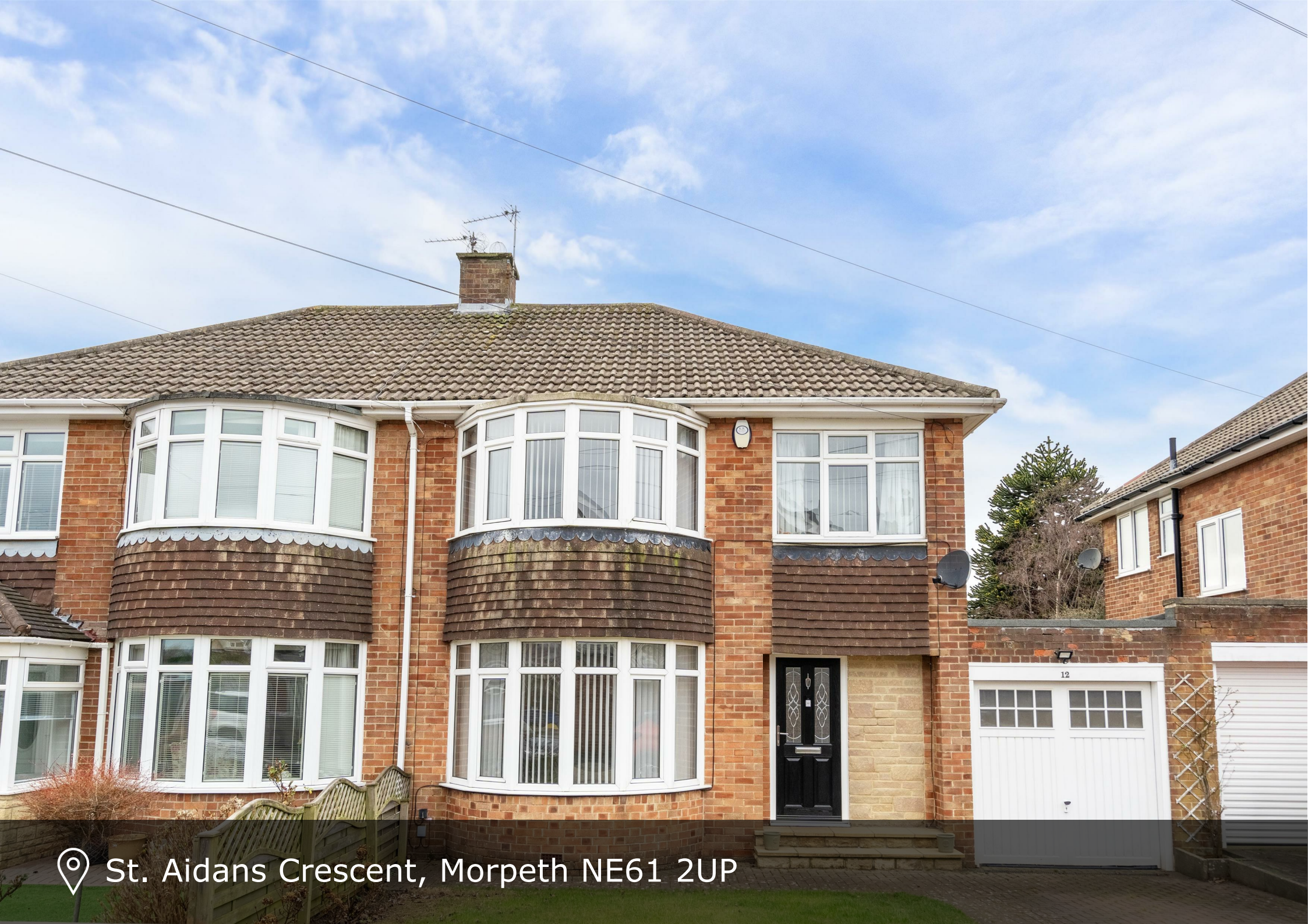
📍 St. Aidans Crescent, Morpeth NE61 2UP