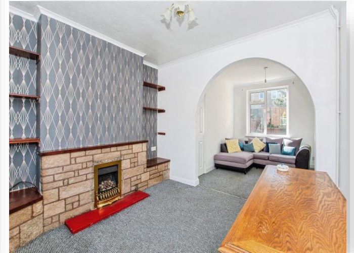
Albany Road, Wisbech PE13 3AY