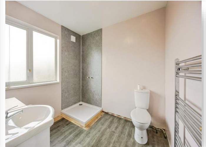
Kettering Road North, Northampton NN3 6HA