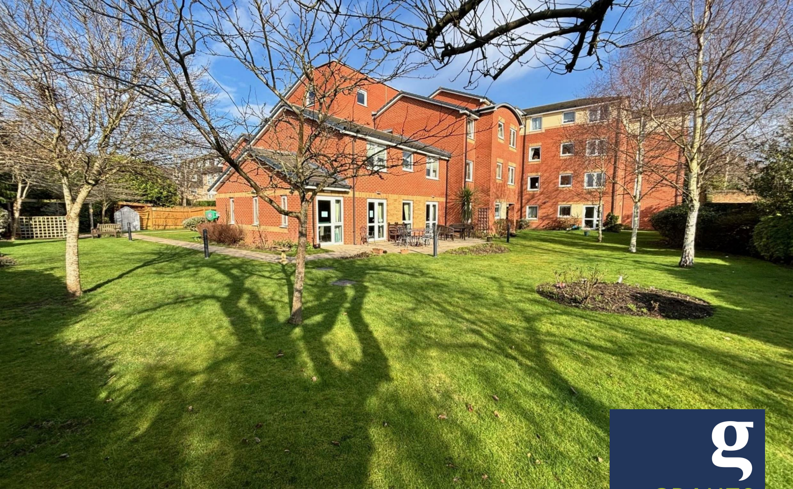
Oaktree Court, Addlestone Park, Addlestone, KT15 1SY