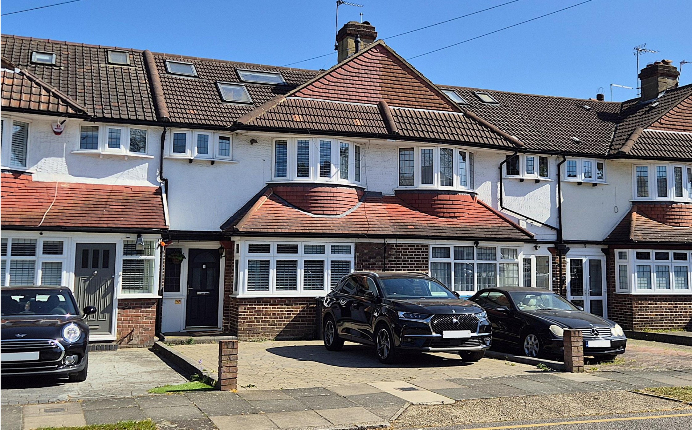
Melbourne Way, Enfield, EN1 1XF