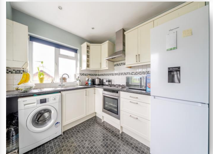
64 Collier Close, Maidenhead SL6 7LE