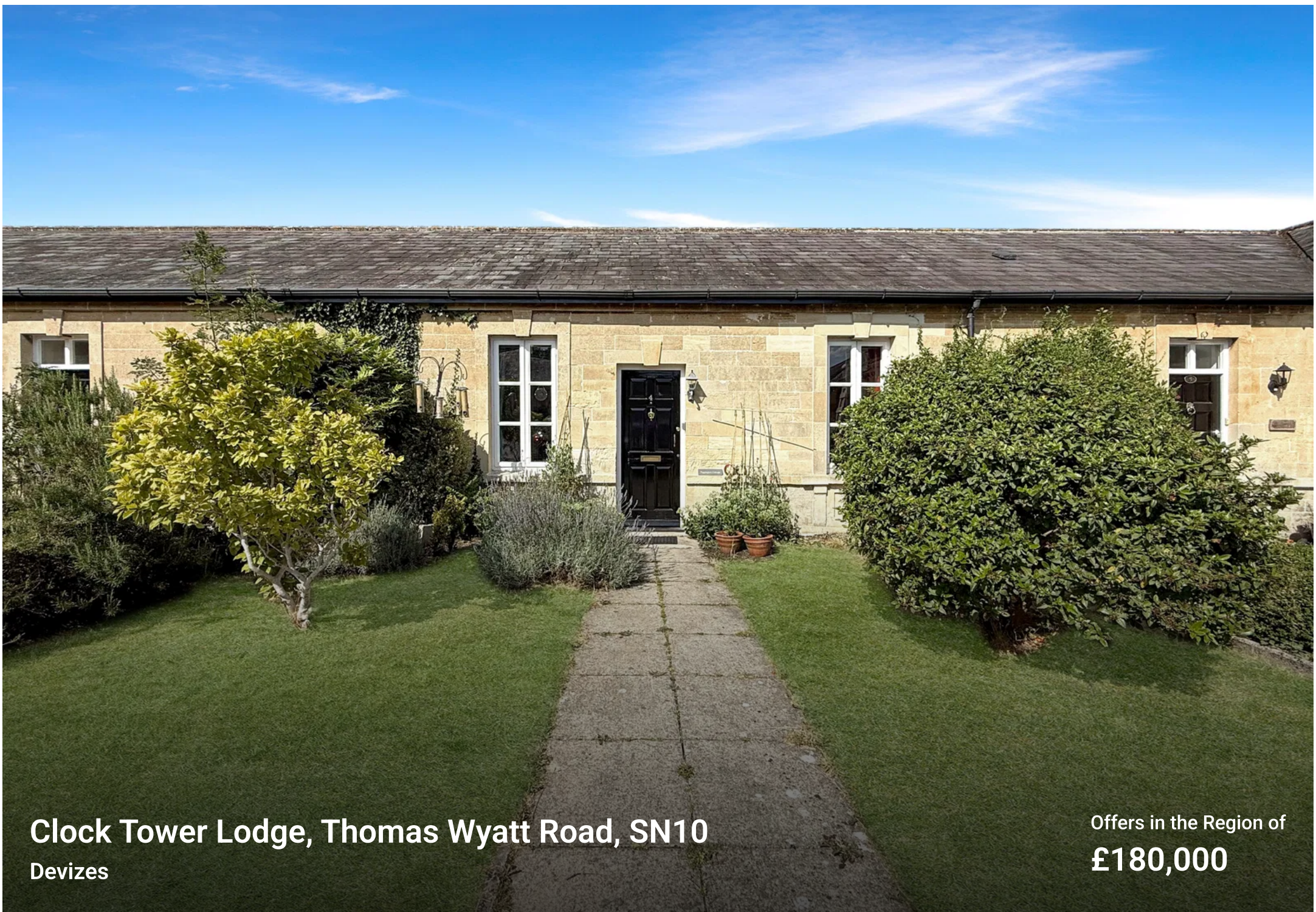
Clock Tower Lodge, Thomas Wyatt Road, SN10 Devizes