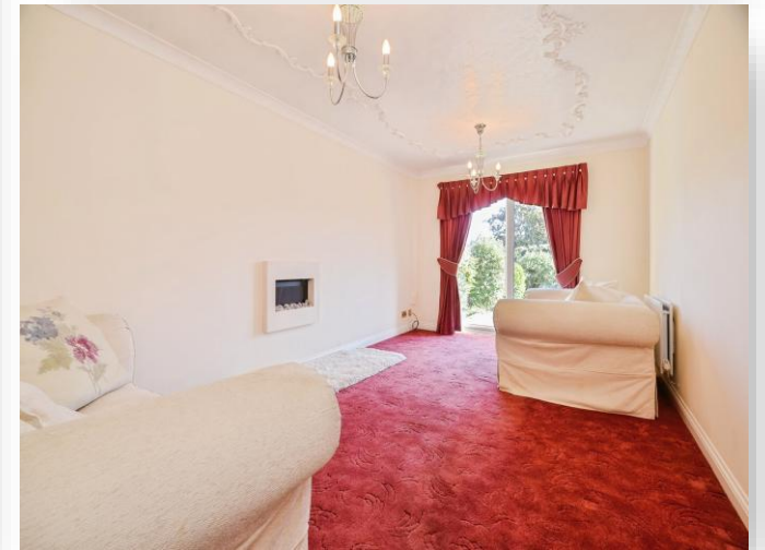
Thurso Close, Stockton-On-Tees TS19 7JD