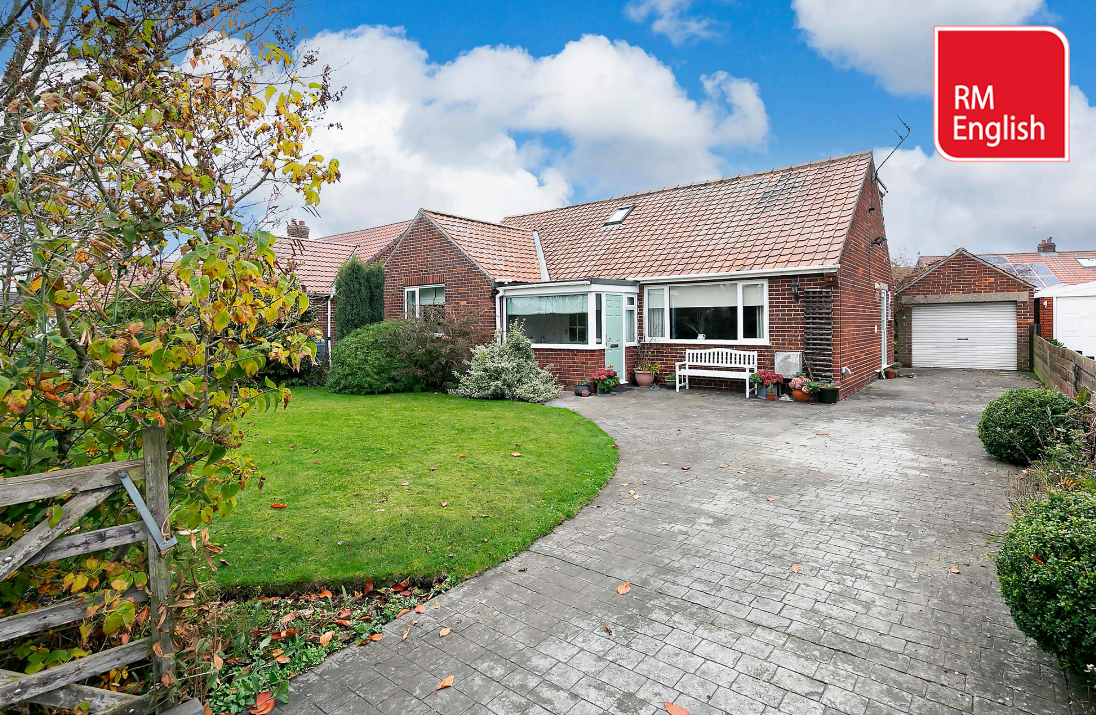
Sands Lane, Holme on Spalding Moor, York, YO43 4EX