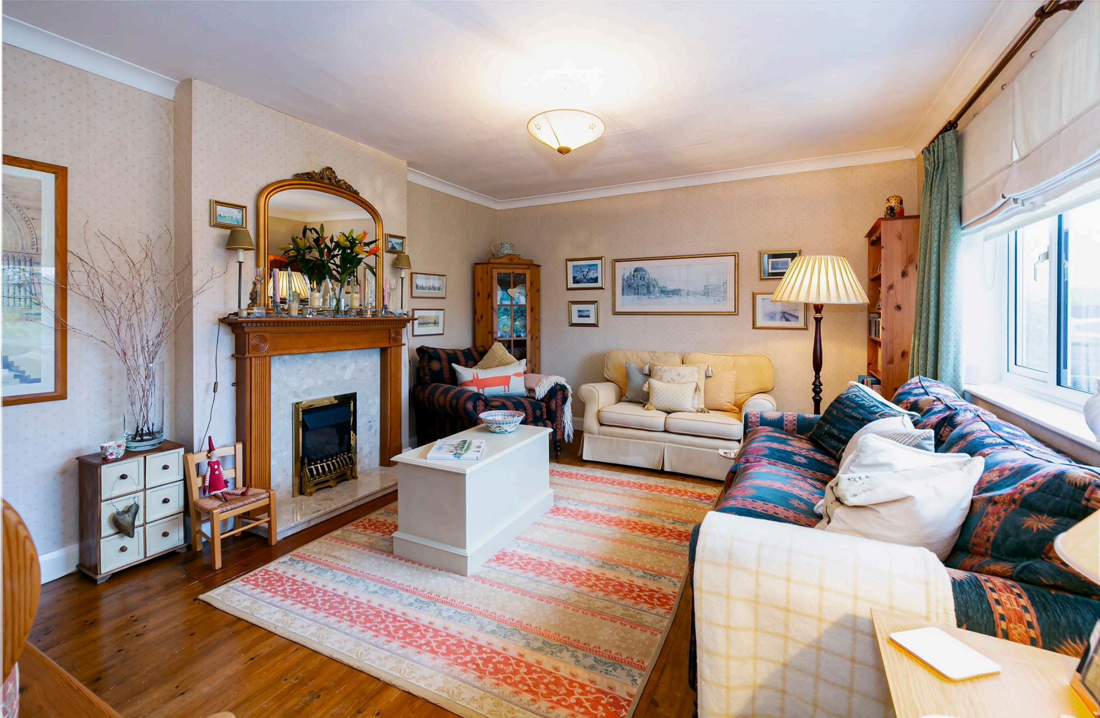
A BEAUTIFULLY PRESENTED FAMILY HOME IN A POPULAR LOCATION