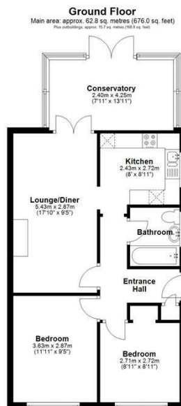
Main area: Approx. 62.8 sq. metres (676.0 sq. feet) Plus outbuildings, approx. 15.7 sq. metres (168.8 sq. feet)