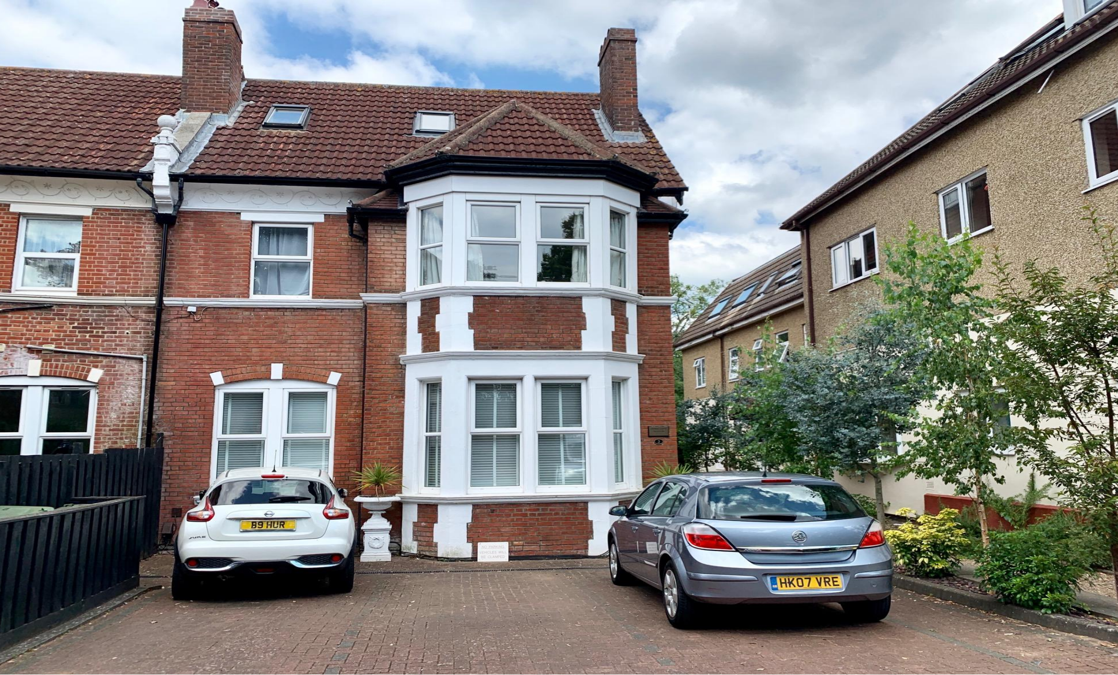
Firtree Lodge, Court Road, Southampton SO15 2JR