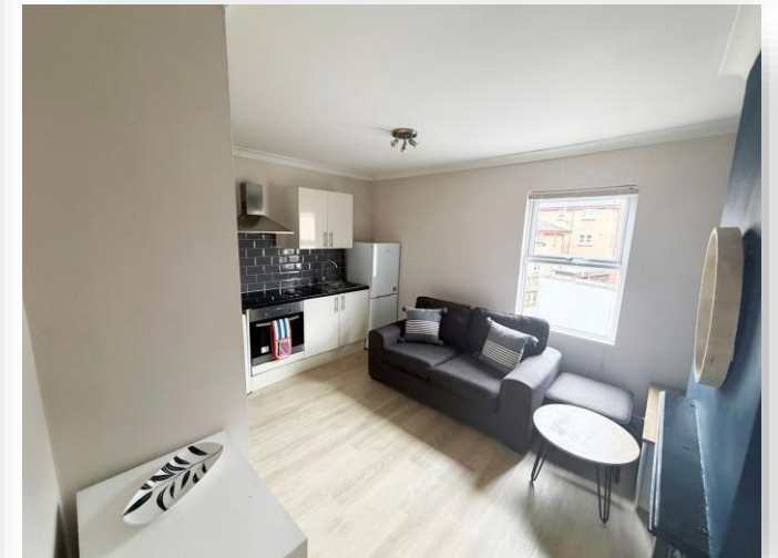
St. Faiths Cottage, New Cut, Newmarket CB8 0HR