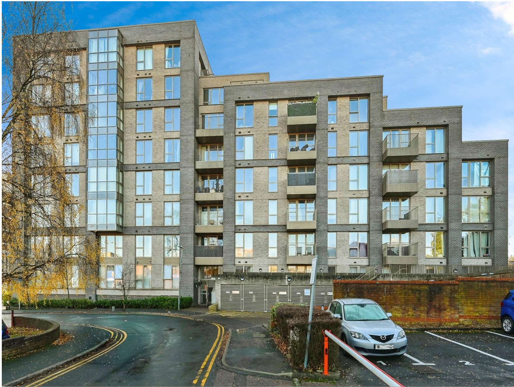
Orchid Court, West Street, Watford, WD17 1BU