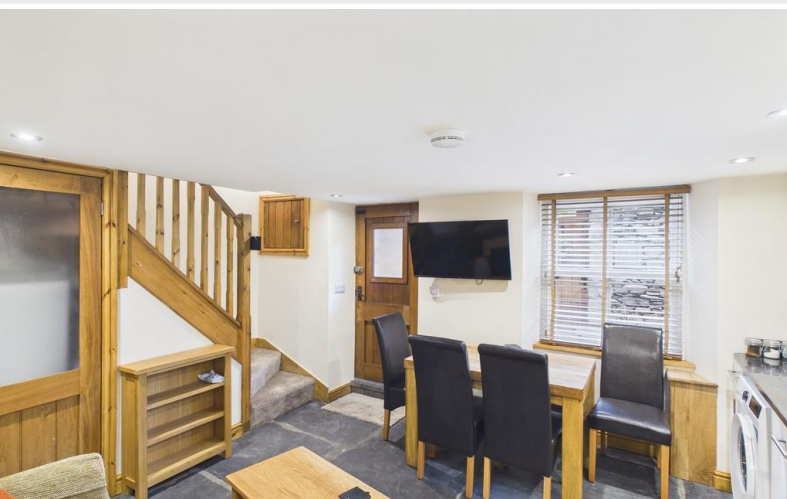
Living room and Kitchen