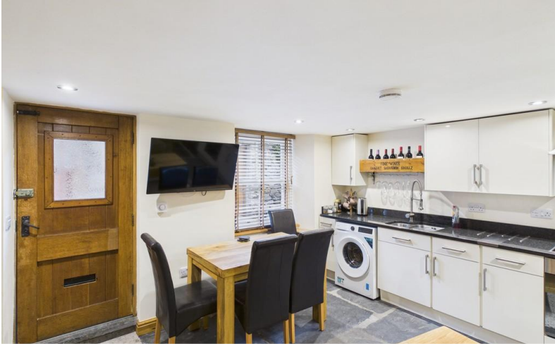
Living room and Kitchen