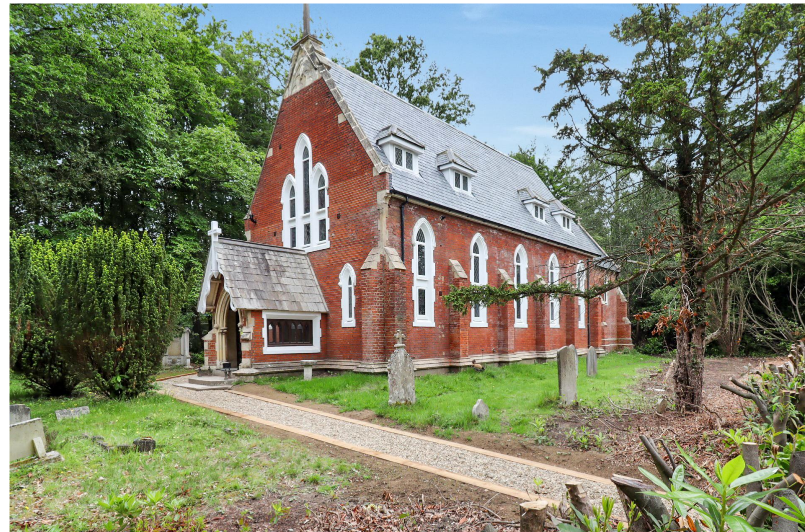
Longcross Church, Longcross