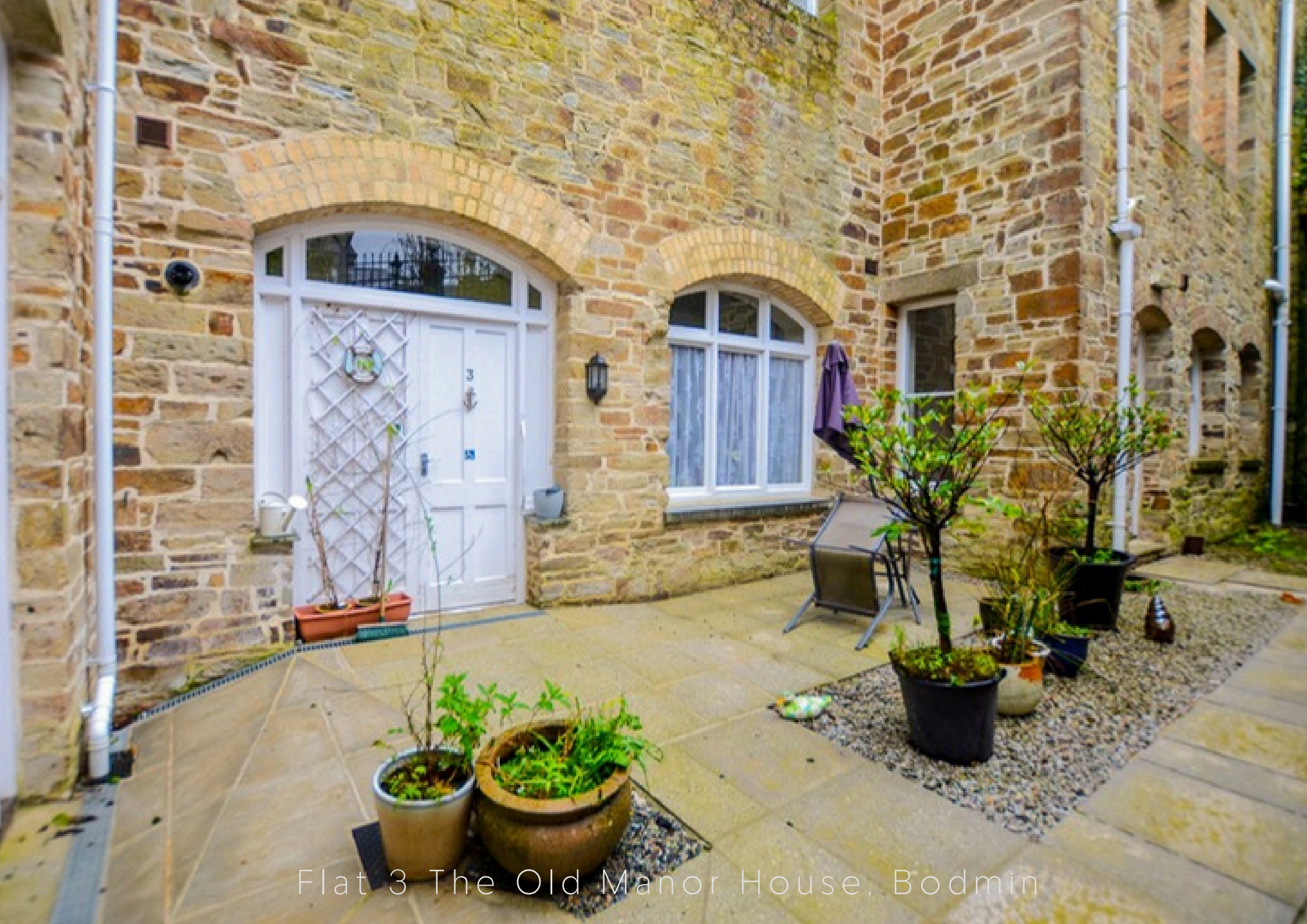
Flat 3 The Old Manor House, Bodmin