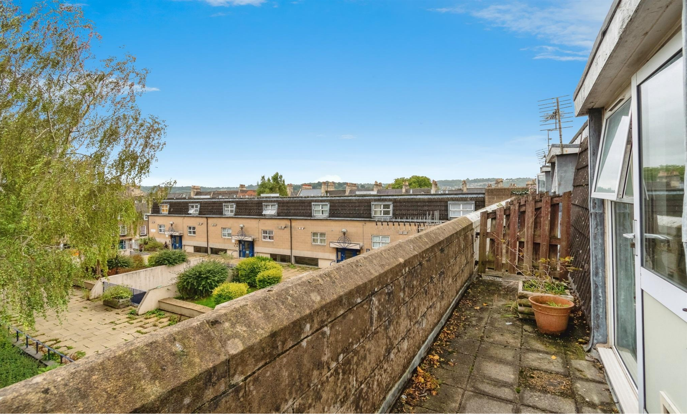
Lampards Buildings, Bath BA1 2RW