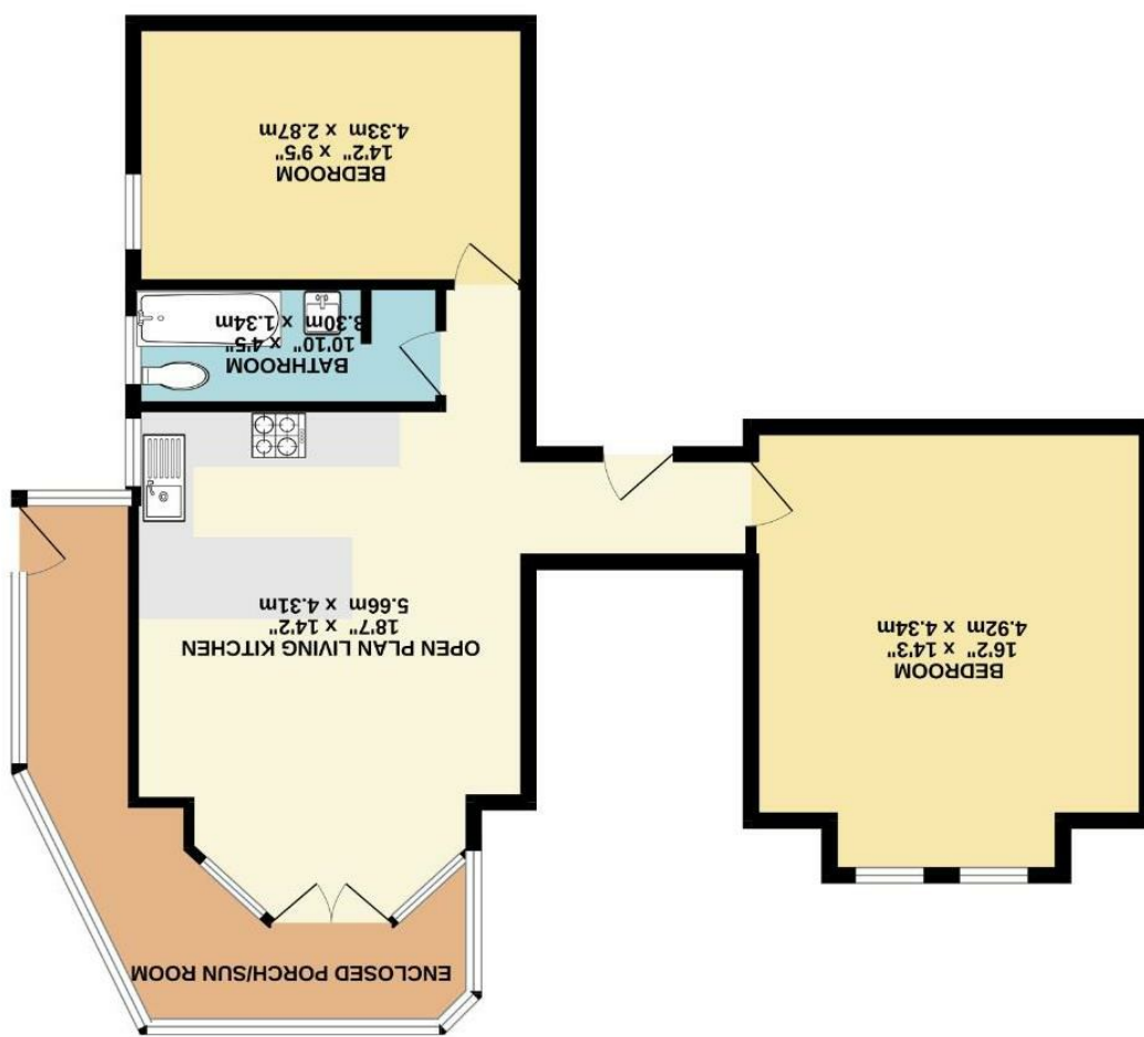
802 sq.ft. (74.5 sq.m.) approx.

Fishwick nor the vendor or lessor accept any responsibility in respect of these particulars, which are not intended to be statements or representations of fact and any intending purchaser or lessee must satisfy himself by inspection or otherwise as to the correctness of each of the statements contained in these particulars. Any floorplans on this brochure are for illustrative purposes only and are not necessarily to scale.