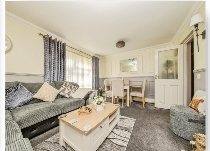
Lethe Grove, Colchester, CO2 8RQ