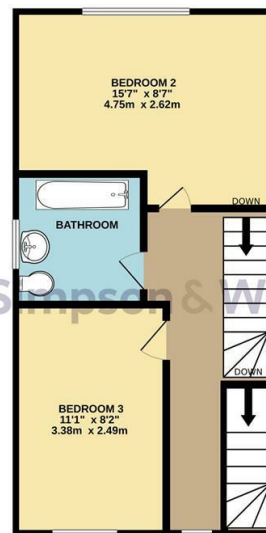
1ST FLOOR 345 sq.ft. (32.1 sq.m.) approx.