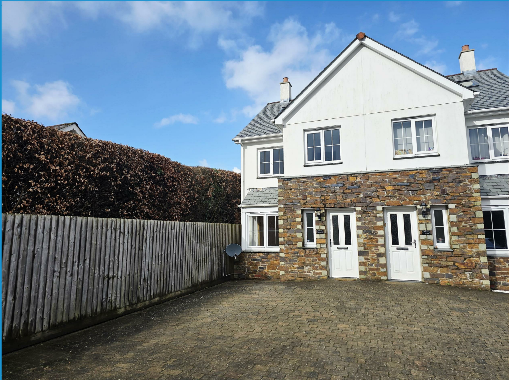
Chitney Cottage Liftdown | Lifton