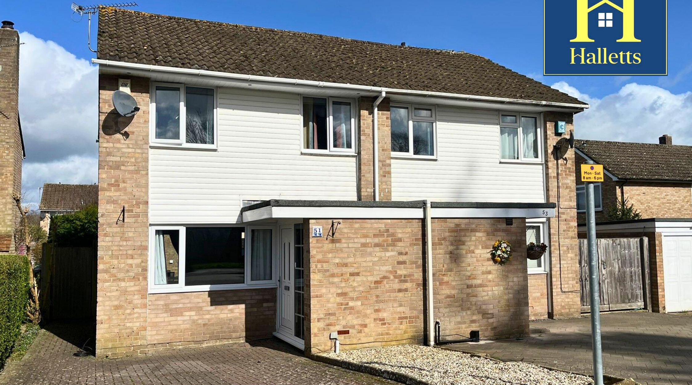
51 Sutton Road Speen Newbury Berkshire RG14 1UW