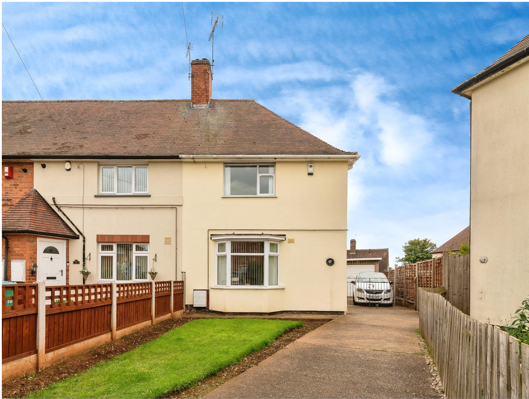
Brinsley Close, Nottingham NG8 5QY