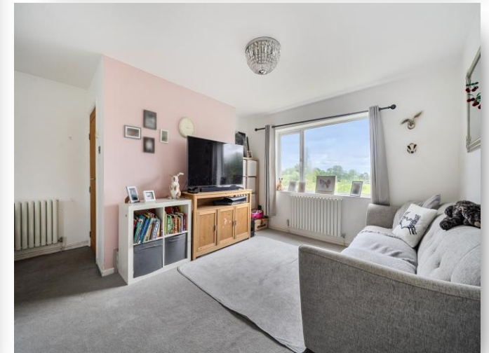
101 Blenheim Road, Maidenhead SL6 5HN