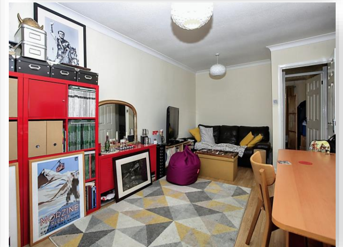
Nathan Close, Peterborough PE3 9NS