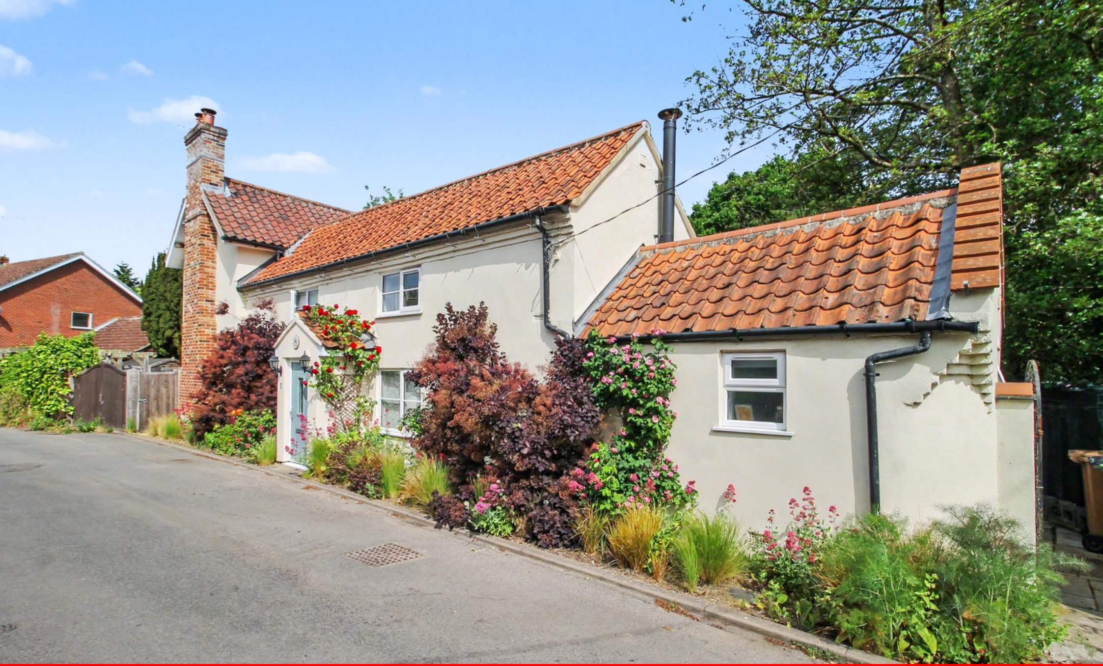
Mallard Cottage, Corpusty