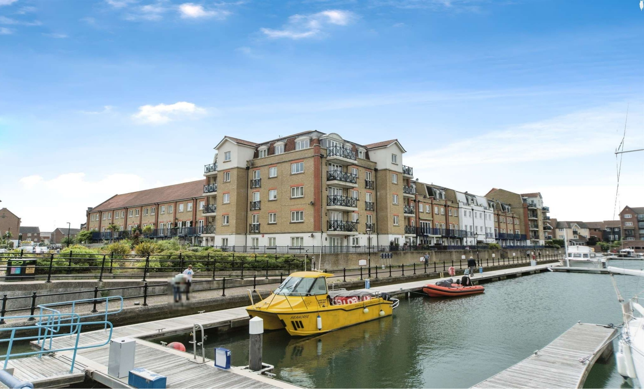
The Piazza, Eastbourne BN23 5TG