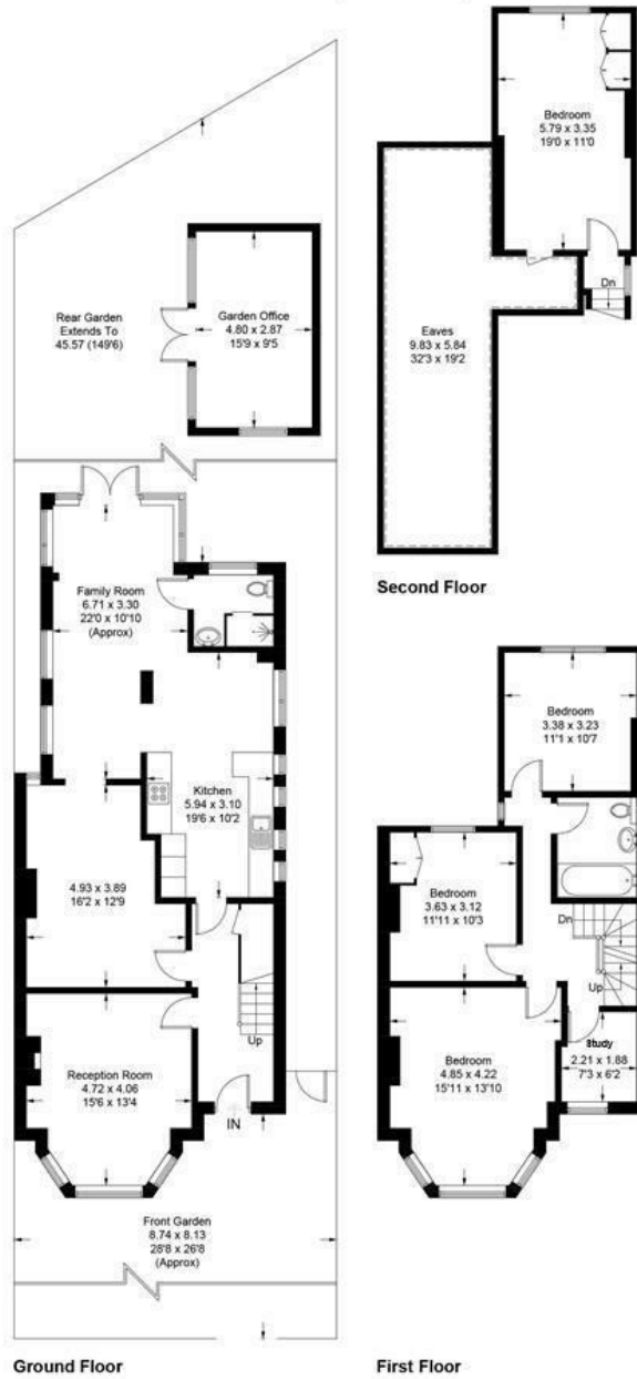
Illustration for identification purposes only, measurements are approximate, not to scale. Fourlabs.co © (ID1240904)