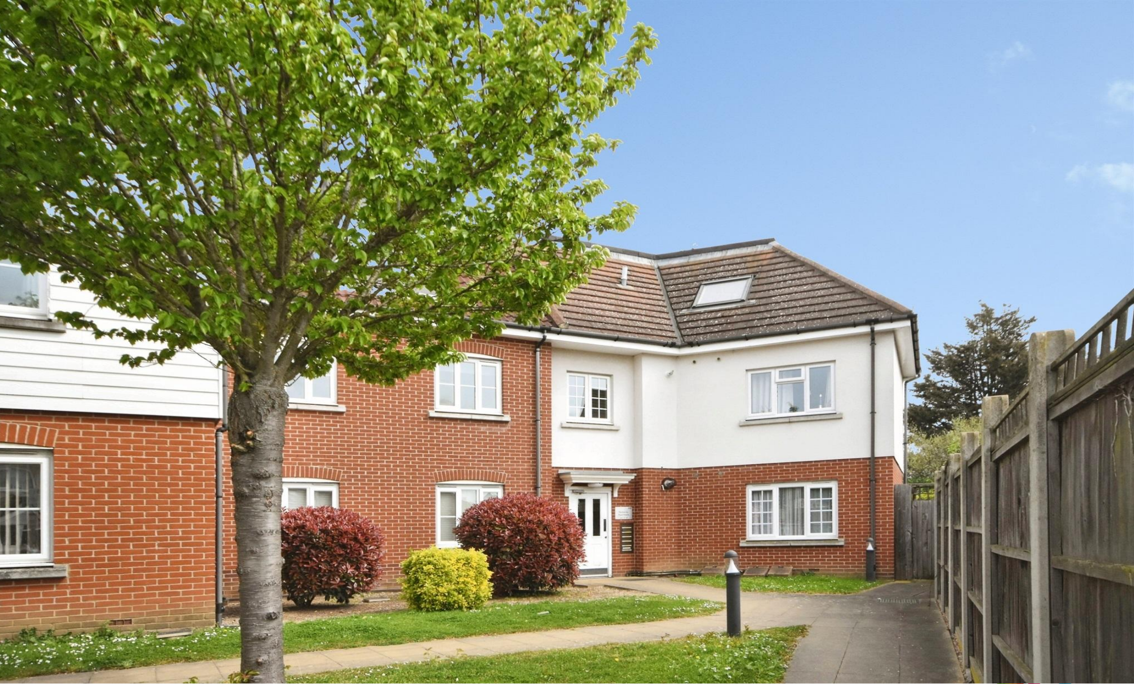
Pemberley Apartments, Gillian Crescent, Romford, RM2 6NU